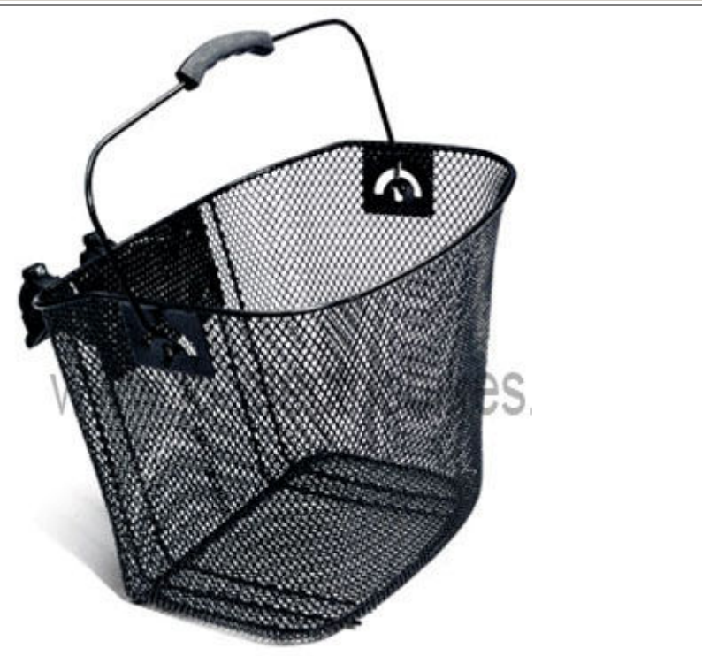
electric bike basket